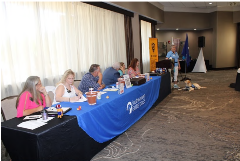
Florida JCI Senate Head Table